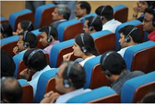
Indian students at IIT Bombay.